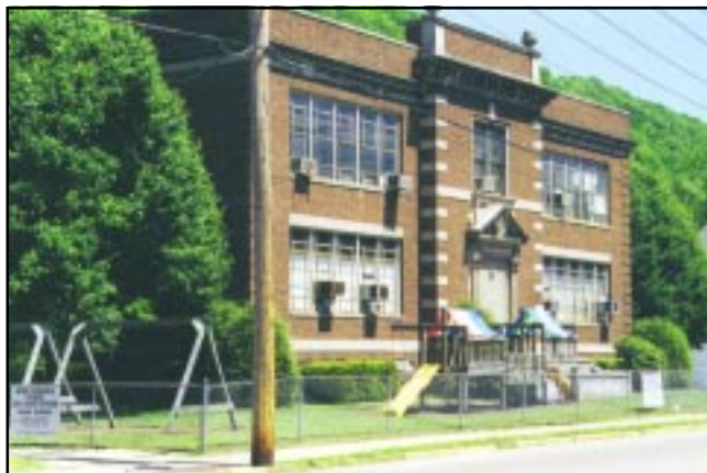
The Public Employees Day Care Center announced plans to expand its facility by renovating the second floor of the building.

Opened on June 13, 1991, the center is a cooperative venture between the state of West Virginia and Kanawha County Schools. The state is responsible for providing the physical space