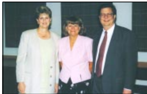
Consolidated Public Retirement Board