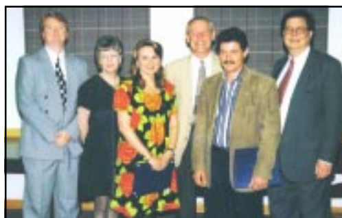
Public Employees Insurance Agency