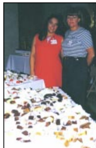
Samples of the 'goodies' baked by state employees were offered following the judging.

The names of the winners and their recipes will be shared in next month's issue of Quotes, Notes & Anecdotes!