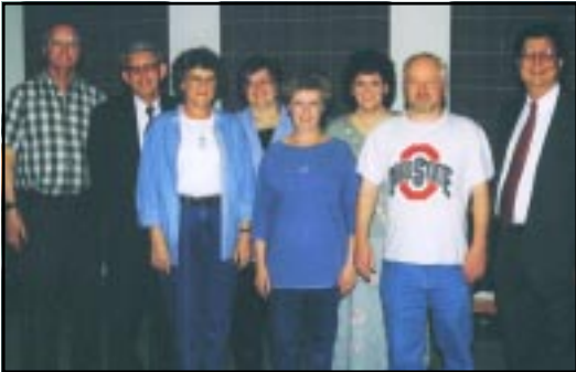
Information Services & Communications