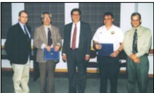
General Services Division