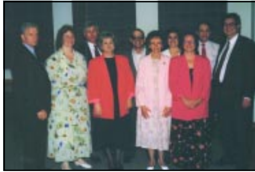
Division of Personnel